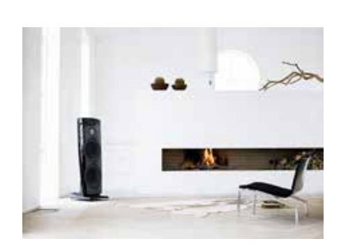
THE LEGENDARY JAMO R 909