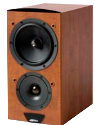
Soundwise, IW 608 FG is comparable with C 603